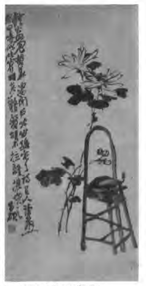
Oil Lamp and Chrysanthemums (64.6 × 32 cm.) By Wu Chang-shih

During this period the Lingnan school of painting, which had assimilated some of the techniques of Japanese painting, flourished in south China. Kao Chien-fu