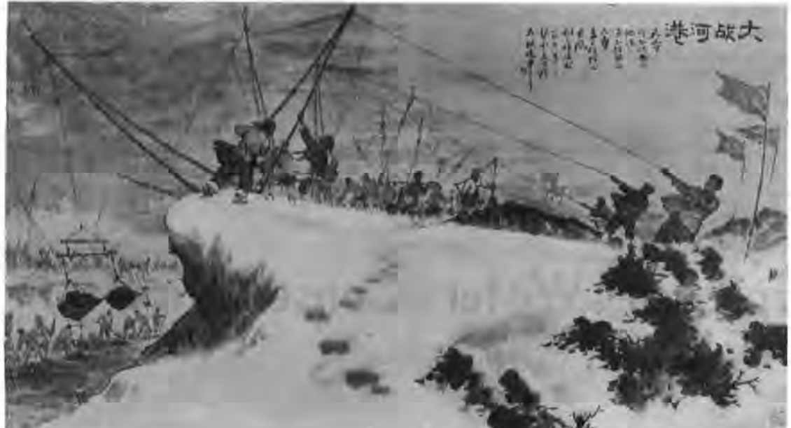
Dredging the canal