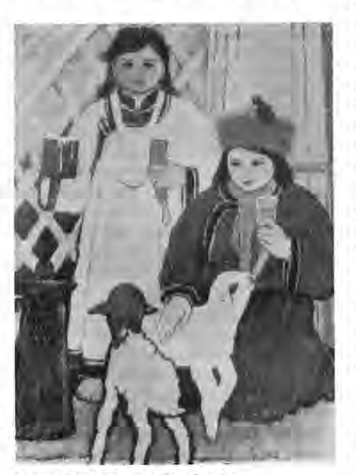
Mongolian girls feeding lambs Painting in oil by Kao Ti

The "month of a million folk songs" started on November 16 in Inner Mongolia gives some idea of the new vigour