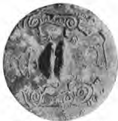
Bronze mirror unearthed at the same site (diameter 6.5 cm.)

A number of the things unearthed were of great interest to archaeologists.