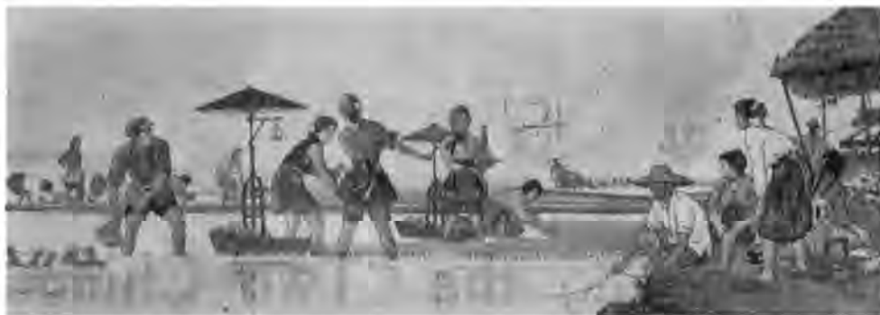
Transplanting rice seedlings

Nanhsiung County in Kwangtung Province is not far from Kanhsien County in neighbouring Kiangsi Province. In the past, both of these southern counties suffered from low crop yields