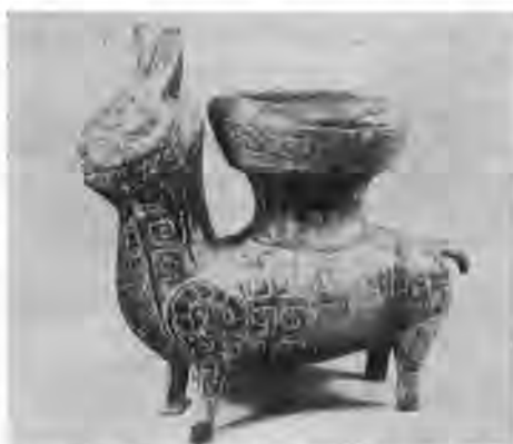
A relic of the State of Gua—bronze vessel unearthed at Shangtsunling, Shenhhsien County, Honan Province (28 cm. × 30 cm.)

Four chariot burial pits were excavated. That belonging to the Crown Prince Yuan Tu of Gua contained ten chariots and twenty horses; two others five chariots and ten horses each; and the fourth only two horses. The wooden chariots had long rotted, but the traces of their outlines were clearly visible. Like those unearthed in Huihsien County in Honan in 1950, which belonged to the