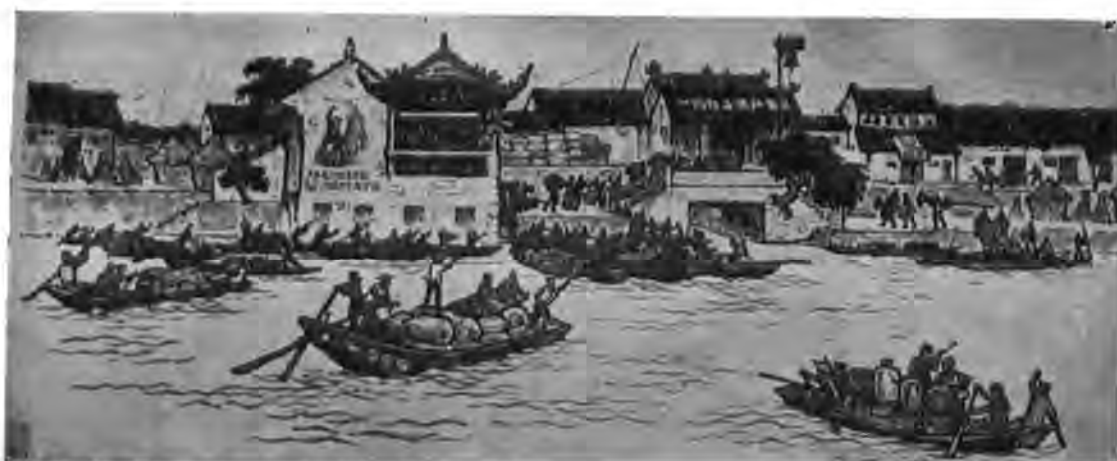
Bring rice to town after the harvest