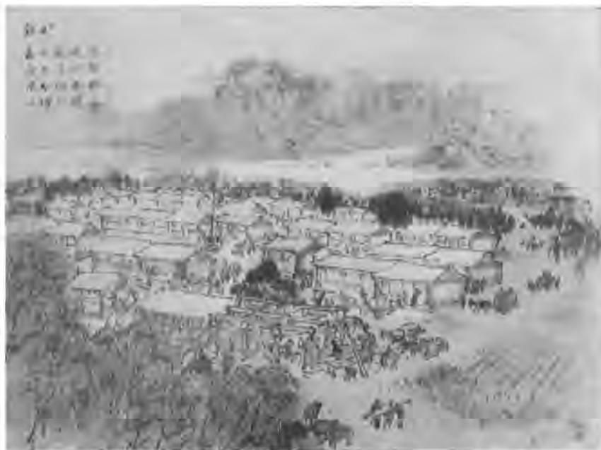
Building homes for commune members in Huailai County, Hopei Province Chinese ink sketch by Yeh Chien-yu

reational activities are regularly held on rest days. It's also a time for reading, studies — or just a quiet, restful day at home. On these days, restaurants, wine shops, tea-houses and food stalls are also much frequented by members of the people's communes. In Pih sien County, Szechuan, where practically all the peasant households eat regularly in their own community dining-rooms, public eating places still do a good business. They have not only increased the variety of dishes they serve but have organized mobile groups to serve the peasants with their specialities in the community dining-rooms. By putting on various minstrel and other performances and providing papers and journals, some tea-houses have become a new kind of rural "cultural centres."