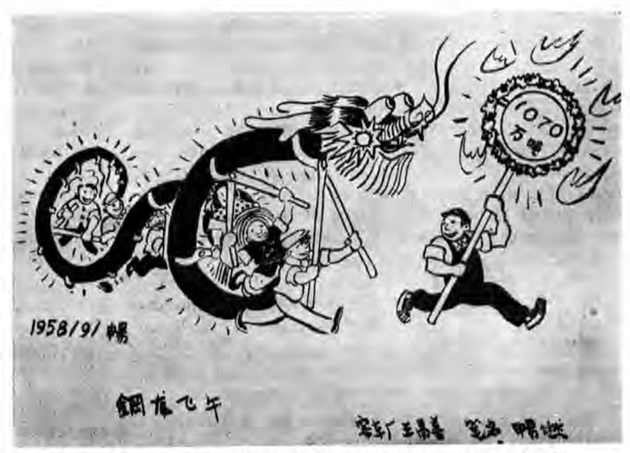
A worker's drawing. "The Dragon Dance for 10.7 Million Tons of Steel" By Wang Chang-shan

When the news of victory was broadcast, the whole nation rejoiced with a sense of personal participation. The news reached the Anshan Iron and Steel Works that night, with the rataplan of drums the clash of cymbals and hiss of fire-crackers. There was dancing and singing. Workers of the first night shift of the No. 2 Steel Mill celebrated by turning out an extra heat of steel. In Peking, 6,000 students and faculty members of the Institute of Iron and Steel held a flying celebration meet-