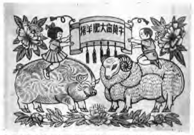
A woodcut in colour designed for the New Year By Huang Yung-yu

In the meantime, the transport drive (Peking Review, No. 42, p. 4) continues. At a telephone conference jointly sponsored by the Ministries of Railways and Commerce on December 22, a decision was made that all non-staple foods and daily necessities that reached the railway stations before New Year must be shipped to their destinations without delay. Food grains, live pigs, frozen meat and delicious tangerines are being rushed to Wuhan, Shanghai and other cities from Szechuan. Special trains are bringing vegetables, pork and mutton from Heilungkiang Province to Peking Tientsin.