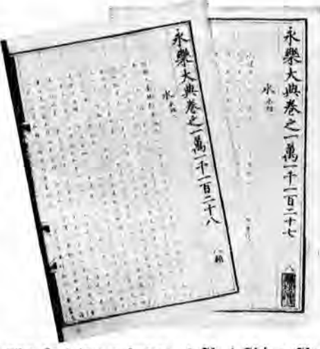
The first two volumes of Shui Ching Chu (Commentary on the Waterways Classic), Volumes III27 and III28 of the Yung La Ta Tien

The fifteenth and sixteenth centuries saw a great deal of scholarly research work; the Chinese encyclopaedic movement reached its climax during the reign of the third emperor Yung Lo (1403-1425 A.D.) of the Ming dynasty. More than 2,000 scholars were employed to compile the Yung Lo Ta Tien, a gigantic work of 11,095 volumes in 22,937 parts. The encyclopaedia, which took five years to complete, was compiled from over seven thousand books from