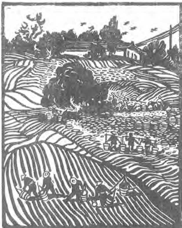
Tending the Fields with Care