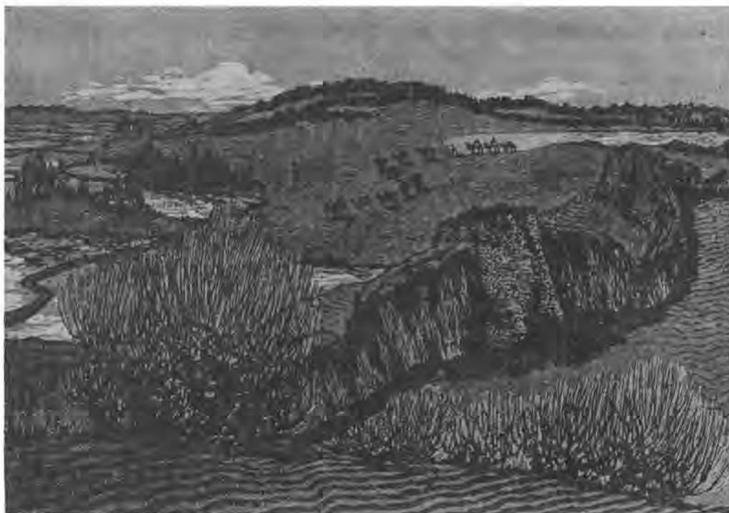
Wind-breaks contain the desert sands by the Great Wall

In this counter-attack against the invading desert the natural trend was to organize facilities and activities on a wider scale. Enthusiasm in afforestation was further heightened when Chairman Mao Tse-tung called on the nation to plant trees all over the country. In 1956, these co-ops broke through the boundary lines that separated