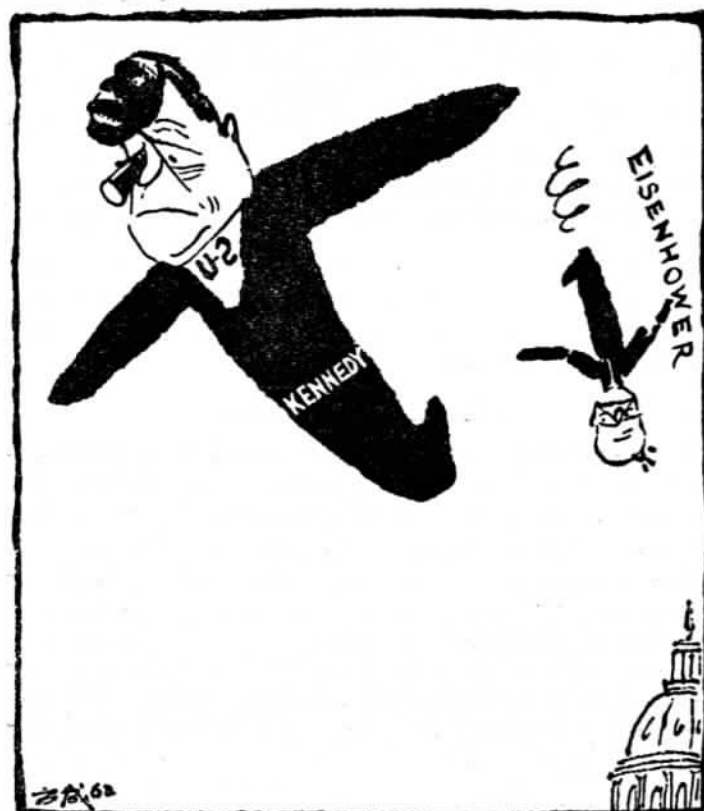
All American crows are black

While stepping up preparations for military adventures in the Far East, U.S. imperialism is carrying on frenzied provocations against Cuba and openly clamouring for an aggressive war against that country. It is also creating new tensions in West Berlin. On September 7,