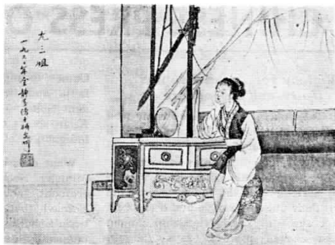
Third Sister Yu, one of the "Twelve Beauties."

This tireless, meticulous craftsmanship, this passion for artistic excellence is a characteristic feature of the art handicrafts of Soochow. It is