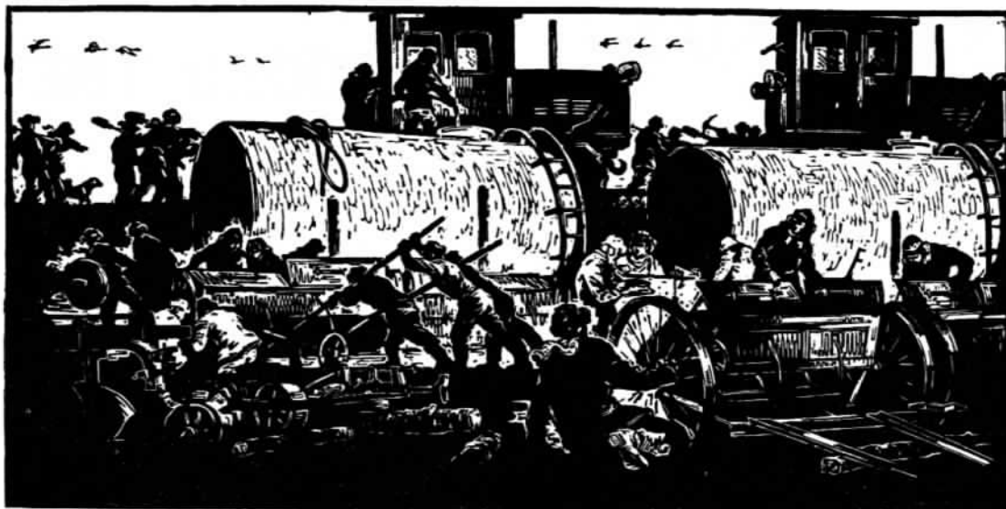
A Tractor Repair Station

One hundred and seventy thousand new college graduates are fanning