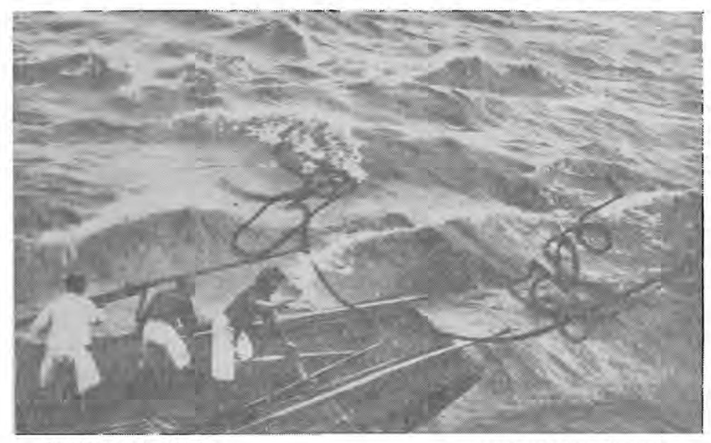
Catching a Line (1935)

The grey tone of these pictures of old China form a striking contrast with others taken after the liberation.