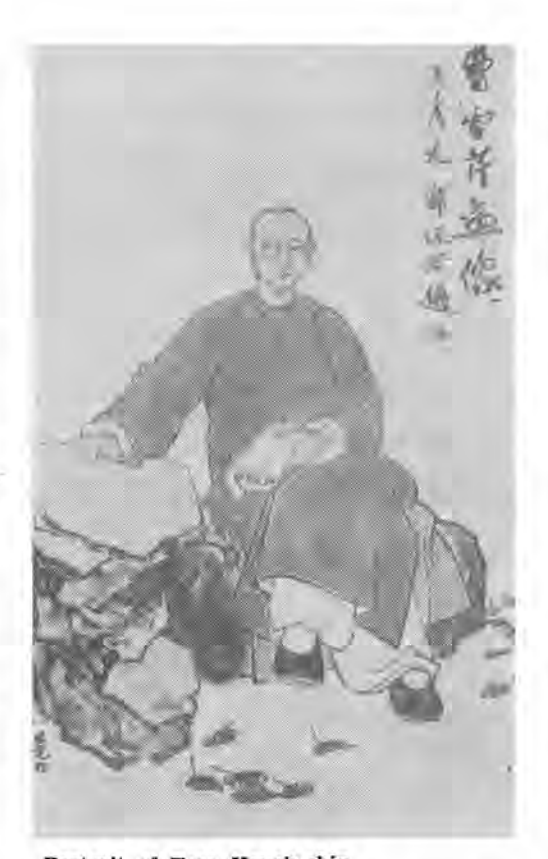
Portrait of Tsao Hsueh-chin Chinese ink and colour painting by the contemporary artist Liu Tan-ise, with inscription by the eminent poet Kuo Mo-jo

Many documents in the exhibition show that Tsao Hsueh-chin wrote his masterpiece in a time of the strictest literary controls and in an atmosphere of rampant terror. Taking over the government from the Ming Dynasty, which had been of Han nationality, the Manchu founders of the Ching had encountered vigorous resistance from the Hans. The Ching rulers were determined to stifle all anti-Ching thought and for this purpose used exceptionally harsh methods including large-scale literary persecutions. If the writings of a dead man were found to hold the slightest hint of nostalgia for the Ming or to contain a phrase or even a single word which could be regarded as satirizing the Ching, this was enough for his coffin to be broken open, his corpse mutilated and his remaining household exterminated. If such "errors" were discovered in a live writer he was done to death without mercy and his family butchered to a man. Seeing at the exhibition the extant files of many cases of such huge literary persecutions, one can easily understand the