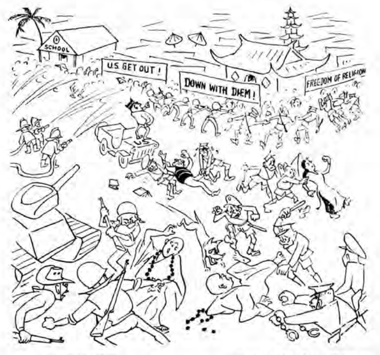
. and abroad