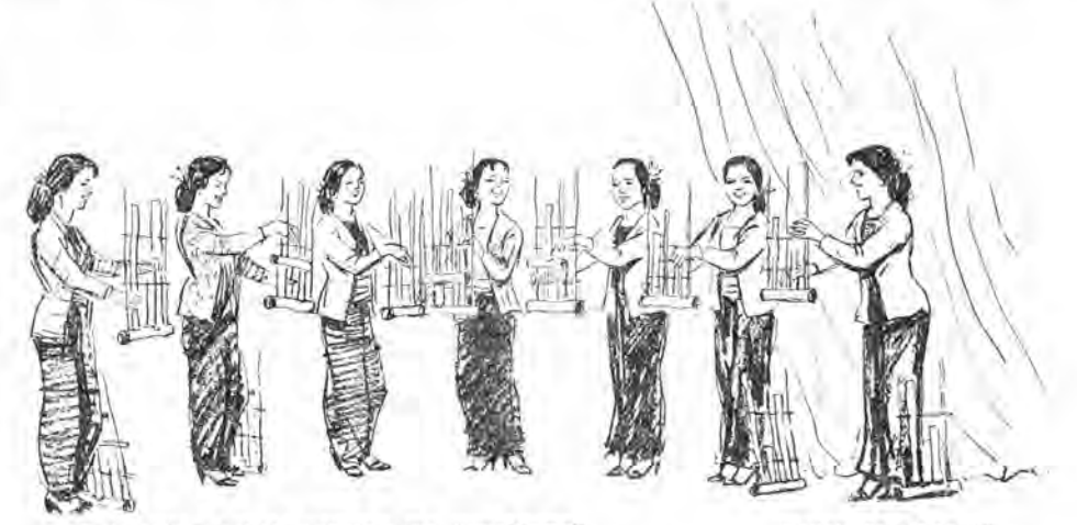
Indonesian artists playing the "angklung"

The performance of the Indonesian song and dance ensemble was militant in content and national in form. Both these reasons ensured their great success with Chinese audiences. Although the ensemble brought over only 30 members on their China tour, they brought here the voice of an independent people staunch in the fight against imperialism and colonialism.