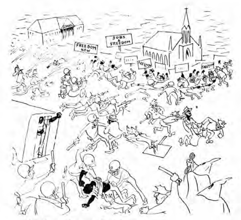
American "democracy" at home

On August 22, according to the Venerable Thich Thien Hao, the U.S .-Diem regime staged simultaneous attacks on all Buddhist temples in south Viet Nam. It sought to suppress by sheer brutality the mounting resistance of the Buddhists to its persecution and repression. In the Saigon area alone, the Diem troops arrested more than 2,000 monks and nuns, among whom were the leaders of the south Viet Nam General Buddhist Association. They killed or wounded numerous defenceless believers. The two biggest temples in south Viet Nam, Sari and Tu Dam, were sacked. Tran Li Xuan (better known as