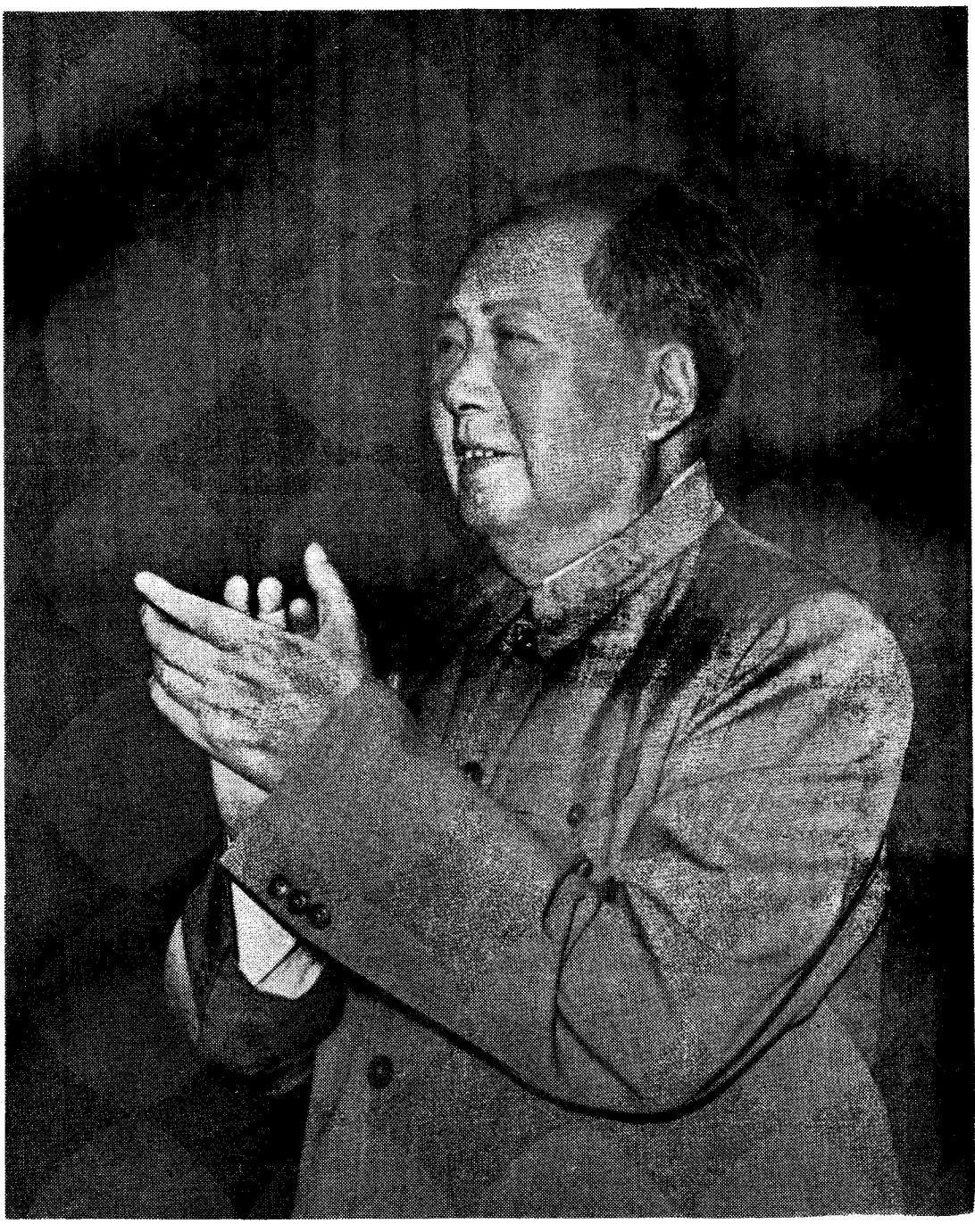
Chairman Mao at the Eleventh Plenary Session of the Eighth Central Committee of the Communist Party of China

tion is one of a new all-round leap forward emerging.