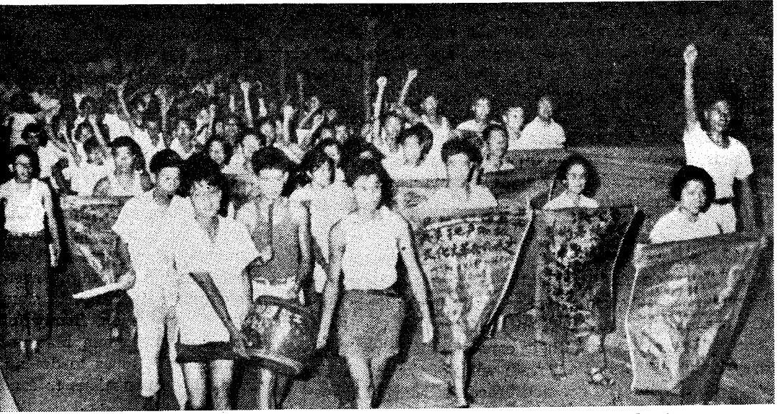
Revolutionary teachers and students of Shanghai's East China Teachers' College elatedly greet the 16-point Decision at an evening demonstration