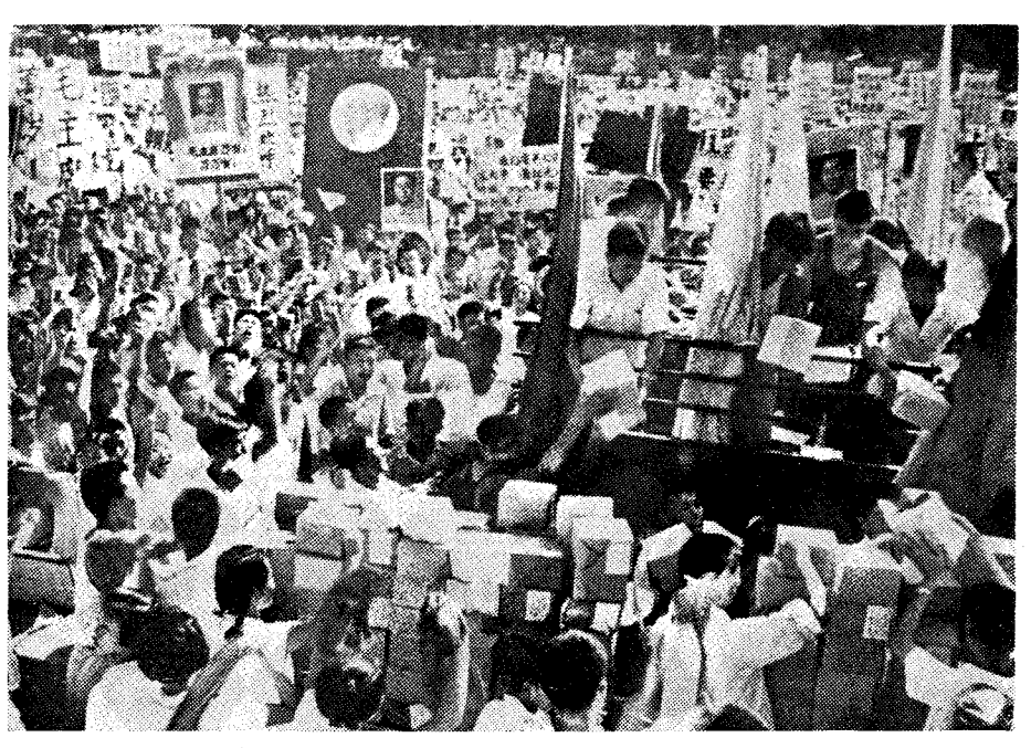
Students of the Peking Iron and Steel Institute greet the arrival of new copies of the Selected Works of Mao Tse-tung

The Party Central Committee decision was made to satisfy this urgent demand, and the people are grateful from the bottom of their hearts for the great political concern the Party has shown them.