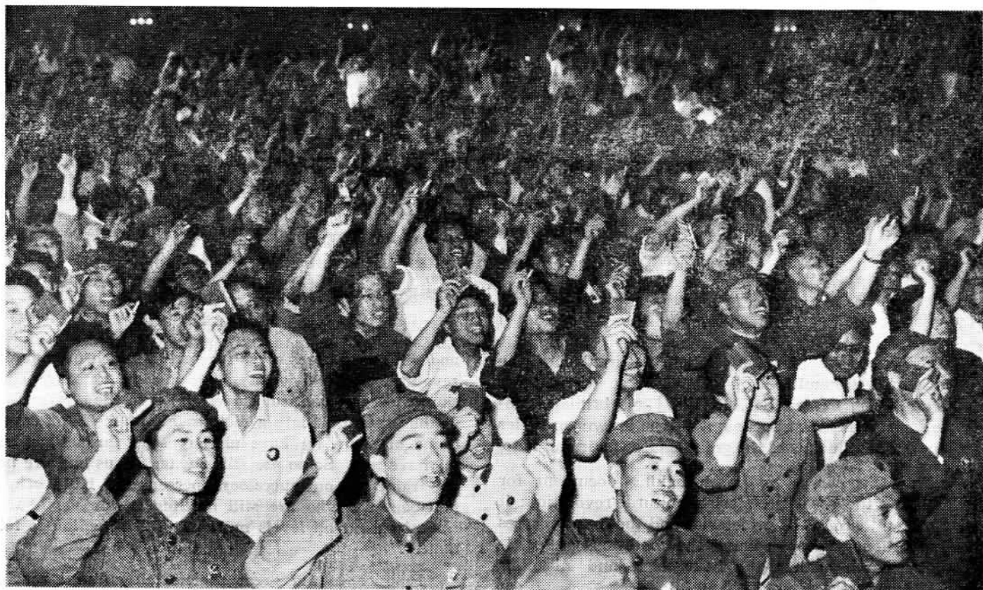
Thousands of red hearts beat excitedly and thousands of smiling faces turn to the red sun. From the bottom of their hearts, the revolutionary fighters wish our great leader Chairman Mao a long, long life!

They declared: "Chairman Mao is the red sun in our hearts. Tens of thousands of words are inadequate to describe our love for him; nor are tens of thousands of songs adequate to express our esteem for him. We will hold the great red banner of Mao Tse-tung's thought still higher, advance from victory to victory, and seize all-round victory in the great proletarian cultural revolution, the first of its kind in the history of mankind."