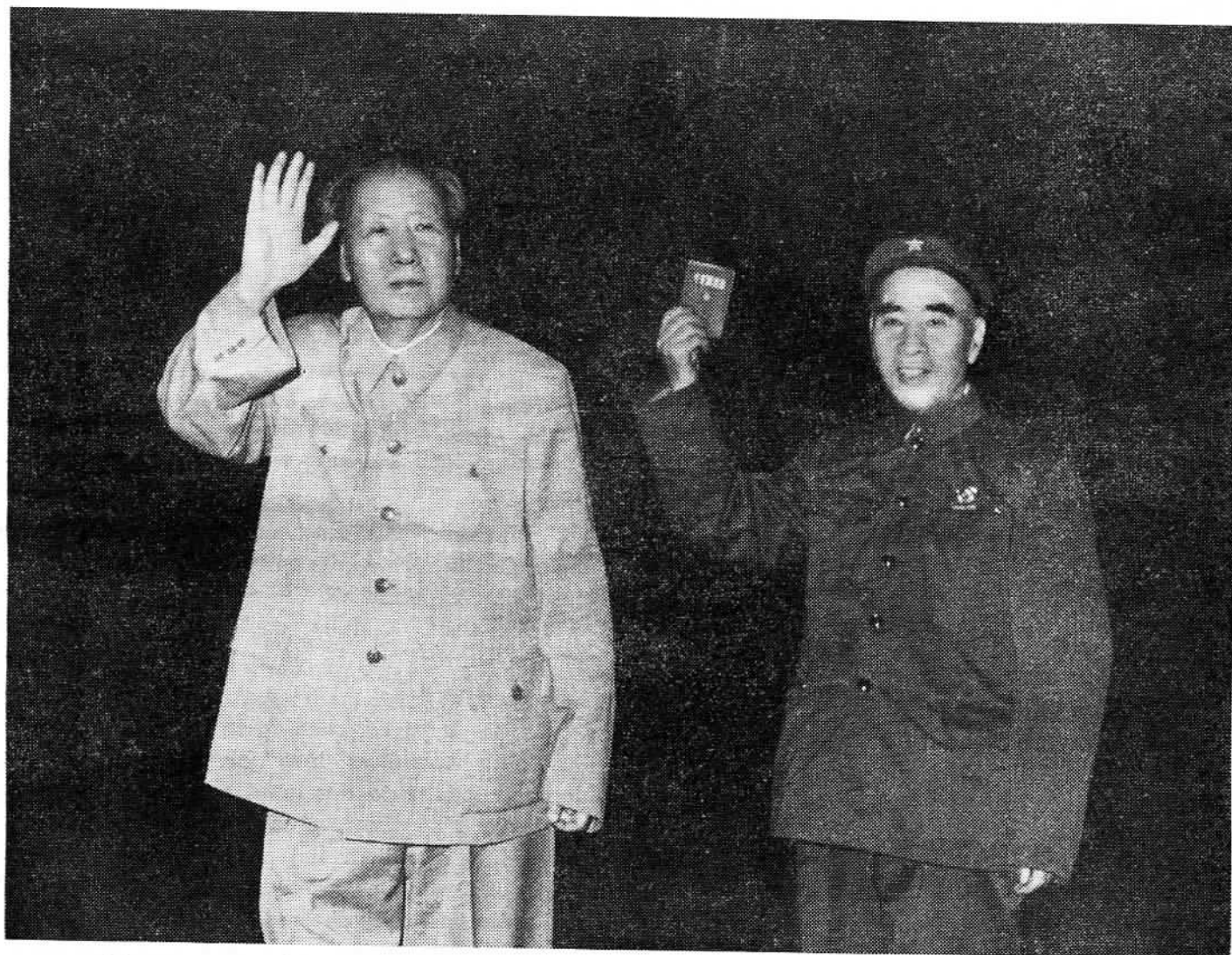
Our great teacher and great leader Chairman Mao and his close comrade-in-arms Vice-Chairman Lin Piao warmly greet the revolutionary fighters from all parts of the country.

Our great leader Chairman Mao and his close comrade-in-arms Vice-Chairman Lin Piao and Comrades Chou En-lai, Chen Po-ta, Kang Sheng, Li Fu-chun, Chiang Ching, Yao Wen-yuan, Hsieh Fu-chih, Huang Yung-sheng, Wu Fa-hsien, Yeh Chun