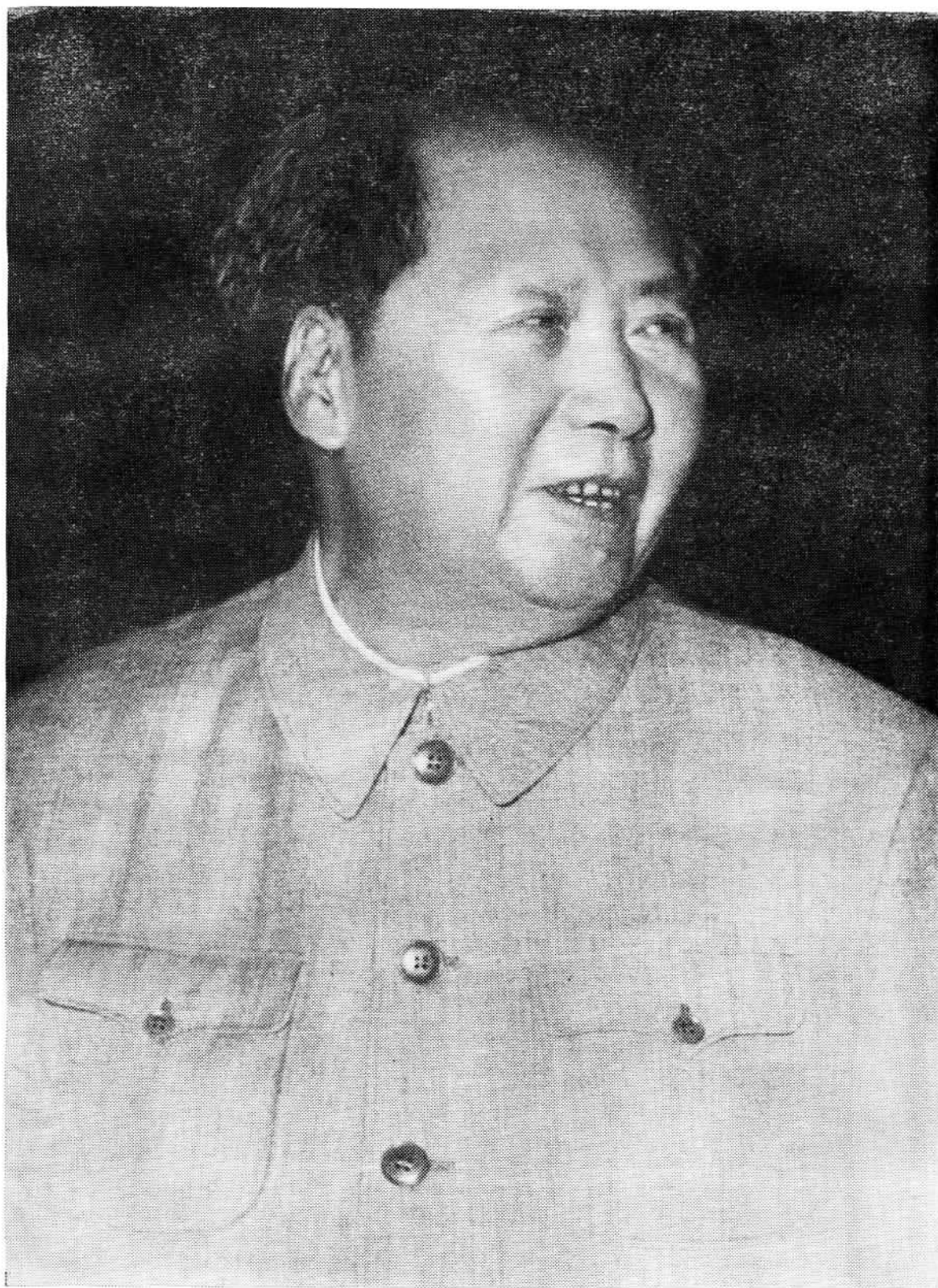
Our respected and beloved great leader Chairman Mao, in high spirits and smiling broadly, with warmth and affection met more than 20,000 revolutionary fighters on May 20.