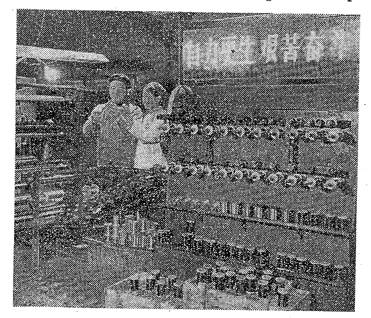
Workers are producing with equipment they made themselves.

land on the outskirts of Liuchow, resolutely carrying out their superior organ's decision to build an alloy material plant. They built a shed out of roof felt, bamboo matting and bamboo poles. They themselves made the required equipment, set up their own technical group and invited two veteran workers who had produced alloy materials in Shanghai to give them technical guidance. They solved the supply of raw materials by using cast-offs from nearby big plants. After repeated trials, they eventually produced a wire drawer and turned out shiny copper wire. The joy of success moved them to tears of happiness.