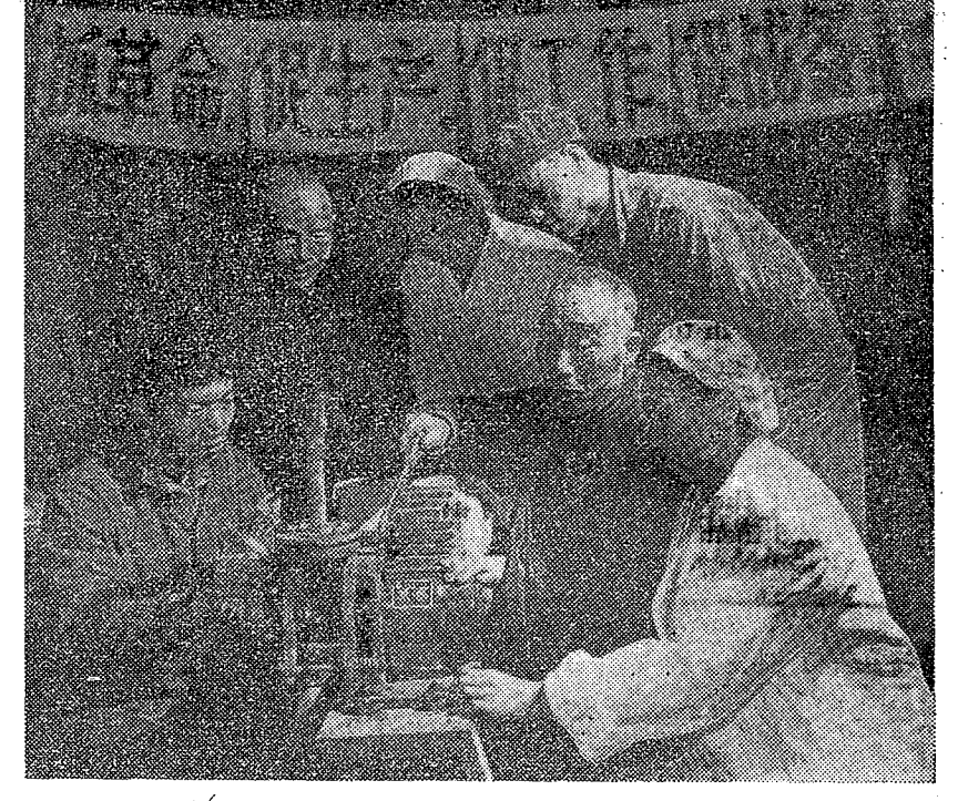
Retired workers help install a tablet-pressing machine.

Many of the machines and parts stored in the warehouse have been put to proper uses. The scope