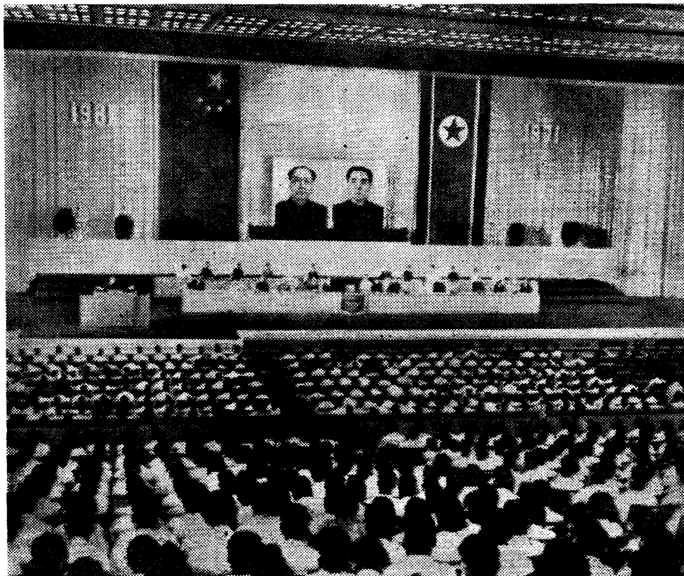
The Pyongyang rally which the Chinese Party and Government Delegation attends.

Both banquets were filled with the warm atmosphere of the sincere friendship and militant solidarity between the people of the two countries.