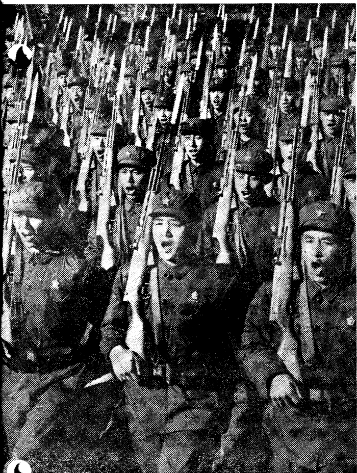
P.L.A. commanders and fighters on the march