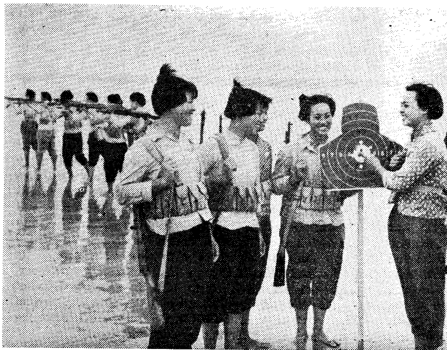
Determined to liberate Taiwan, militiawomen at the Fukien front are training hard.