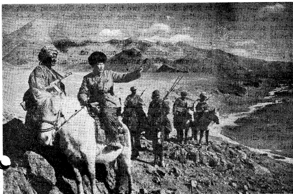
P.L.A. commanders and fighters stationed in Tibet's Ahli Area patrolling together with local militiamen of various nationalities