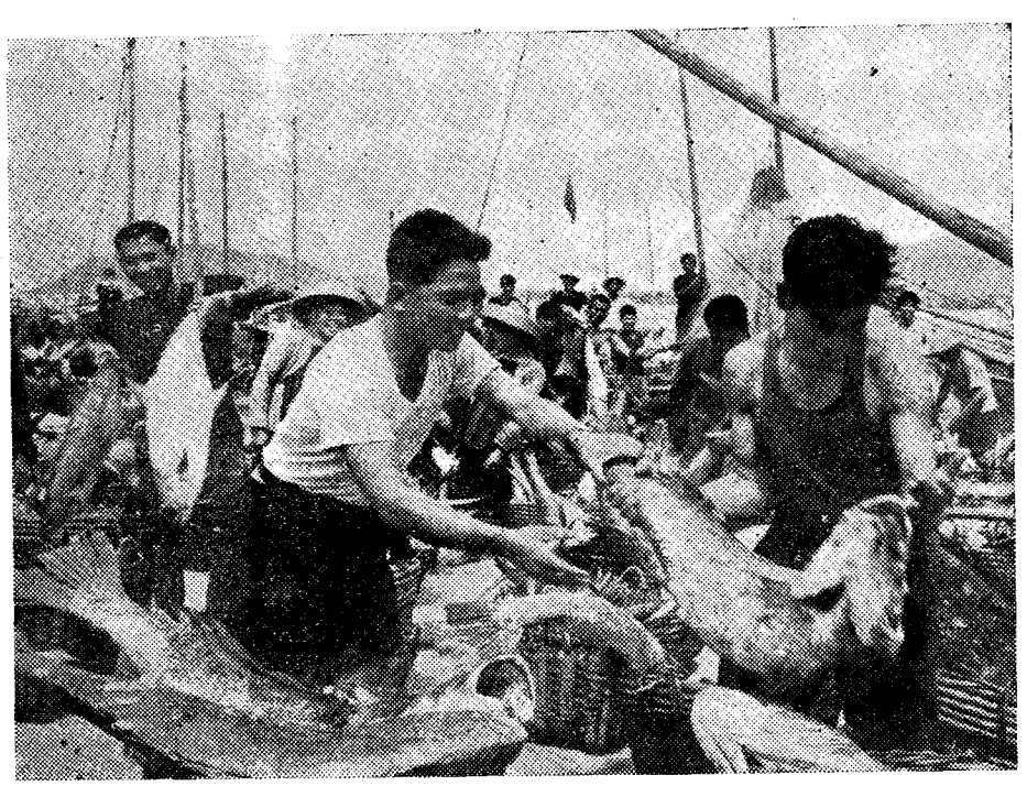
A good haul

RISHERMEN and cadres in China's fishing areas have had all-round achievement in catching and cultivating aquatic products this year by exploiting and making full use of the country's rich fishery resources. According to statistics from 11 major fishing provinces, two municipalities and one autonomous region including Liaoning, Shantung, Shanghai, Fukien, Kwangsi, Hunan and Heilungkiang, the first half year's fish haul was over 10 per cent bigger than in the same 1970 period. The July and August catch was also more than in the previous corresponding slack season. At the same time, the freshwater fish breeding area was ex-