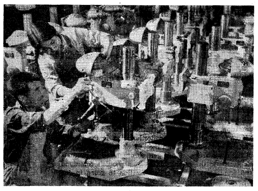
Bench drills made in the electric machinery plant of Tsunhua County, Hopei Province.

A number of big national enterprises serving agriculture such as tractor plants and chemical fertilizer plants have been built to support agriculture. But it is local industry which can support agriculture most directly, promptly and effectively. The big tractor plants run by the central industrial departments can produce only some kinds of tractors suited to the general needs of most areas but cannot make farm machines for special use in specific places. This problem has to be solved by local industry. Now more than 20 provinces, municipalities and autonomous regions have built plants to produce tractors, engines, farm tools and machine parts. About 90 per cent of the counties have agricultural machinery plants which also do repairs. This is also true for the chemical fertilizer industry. Though the central industrial departments have set up a number of big chemical fertilizer plants, they cannot meet the needs of agricultural production. We must rely on chemical fertilizer plants run by provinces, counties and people's com-