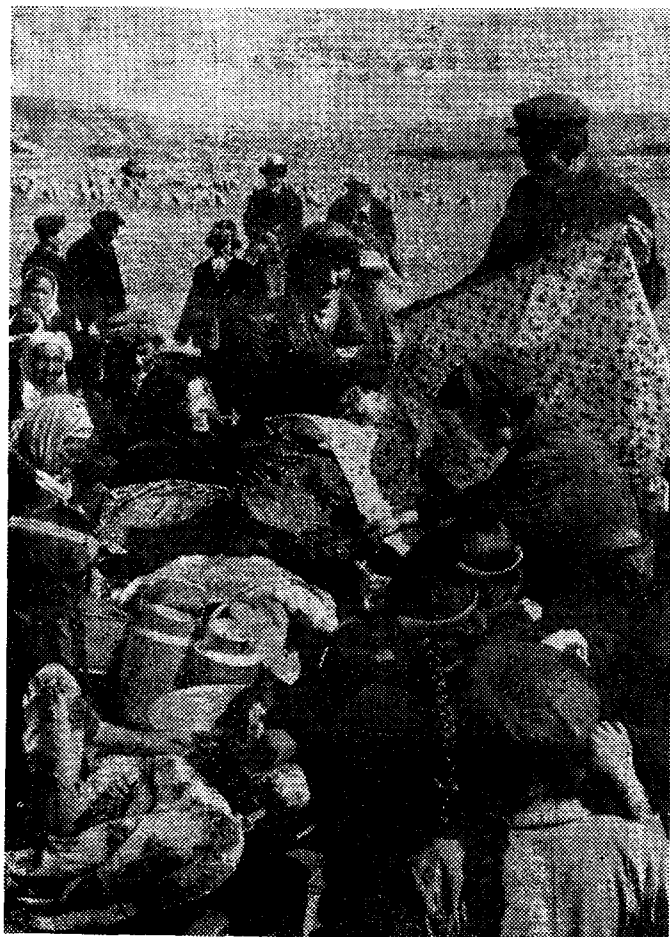
A mobile stall in Sinkiang's Hsinyuan County comes to a Tianshan pasture.

With the increase in their income and rising living standards, the workers and peasants now have enough money for savings accounts to support national construction. Total bank savings by the end of 1970 in China were 28 per cent higher than in 1965.