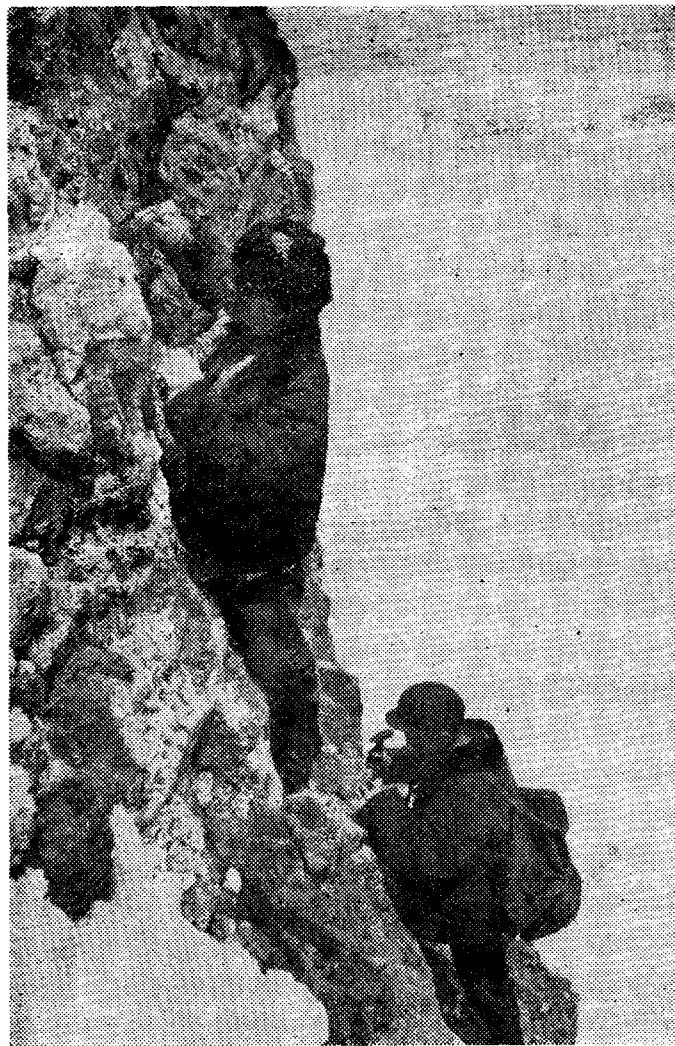
Geological team members taking rock samples more than 6,000 metres above sea level.

Expansion of the iron and steel industry has promoted the development of industry as a whole.