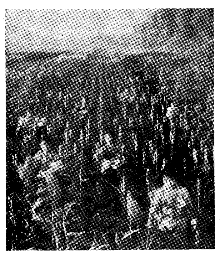
Members of a scientific research group of the Chitsun Brigade in Hsinhsien County pollinating a new strain of sorghum artificially.

The production brigades I visited generally had their own scientific research groups and experimental plots. In many Hsinhsien County brigades, such groups were very active in studying many aspects of agricultural production. They experimented on small plots and popularized their achievements in large areas. The good strain of sorghum widely popularized in Shansi this year was obtained by the Liushih Brigade after experimentation. Per-mu yield of such sorghum generally reached over 1,000 jin, the highest more than 2,100 jin. The brigade's scientific research groups began cultivating high-yield seeds on two-fifths of a mu and the acreage sown to such seed has been extended to more than 320 mu. They increased the number of crops included in research items from two - sorghum and maize - to a dozen or so and the seed strains they experimented on rose from several to over 2,000. Apart from meeting Shansi's needs, the brigade has in the past three years supplied 25 other provinces and cities with more than 2.3 million jin of good strains, including maize and sorghum.