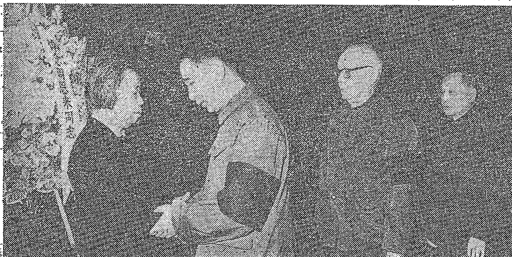
Comrades Wang Hung-wen, Yeh Chien-ying and Teng Hsiao-ping extending sincere condolences to Comrade Teng Ying-chao.

Representatives of workers, peasants and soldiers and people from other walks of life, patriotic personages, medical personnel and personnel who had worked at the side of the Premier also were present.