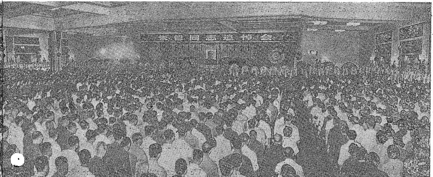
At the memorial meeting for the late Comrade Chu Teh.

We should learn from his fine proletarian style. He upheld Party principles, observed Party discipline, safeguarded the unity of the Party, and maintained close ties with the masses. He was modest and prudent, unassuming and approachable, plain in his style of living and hard working. He set an example by his conduct for others to follow. He firmly opposed all