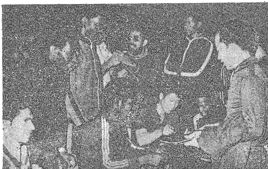
Players from three continents exchanging autographs and giving each other pointers on the game.