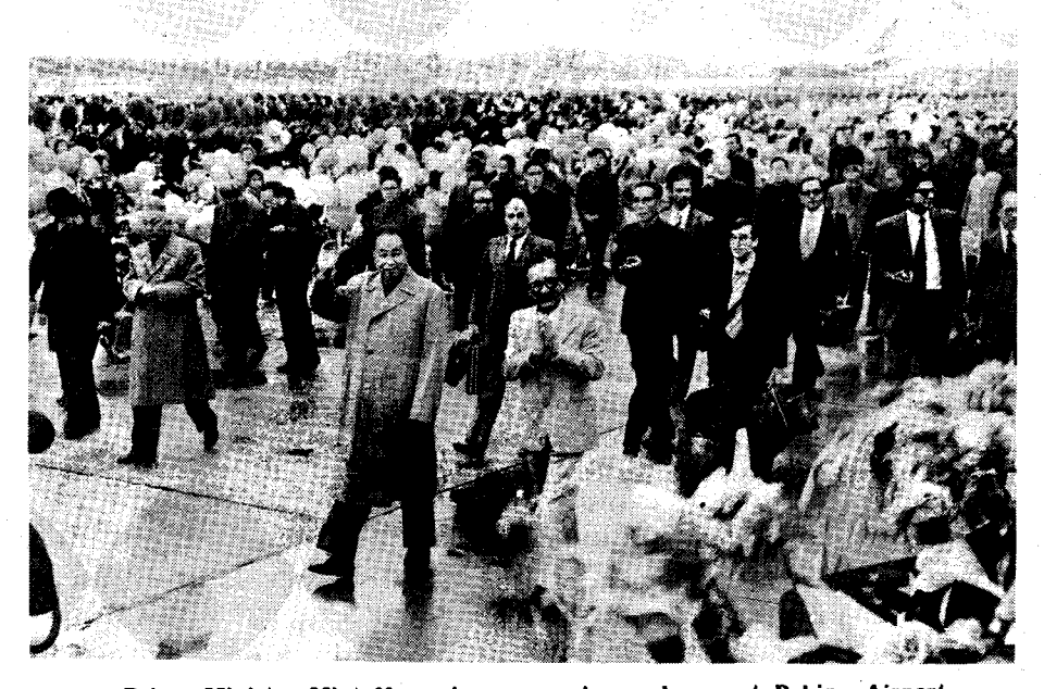
Prime Minister Mintoff receives a rousing welcome at Peking Airport.