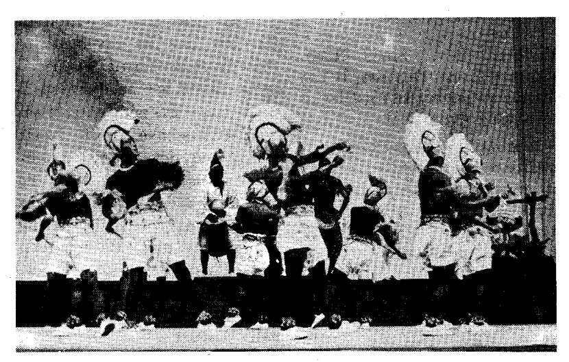
A Malian dance.

Spray irrigating increases grain yields and saves water, with the added advantage of conserving plant nutrients, maintaining soil texture and regulating the microclimate about the fields. Sprinkler