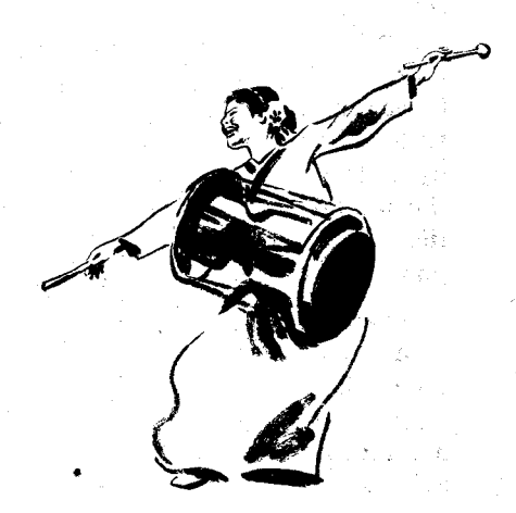
Long Drum Dance, which is popular among the people of China's Korean nationality.

labour of Japanese peasants, Ethiopian herdsmen and girls of Sri Lanka, and merry-making at festival time of the people