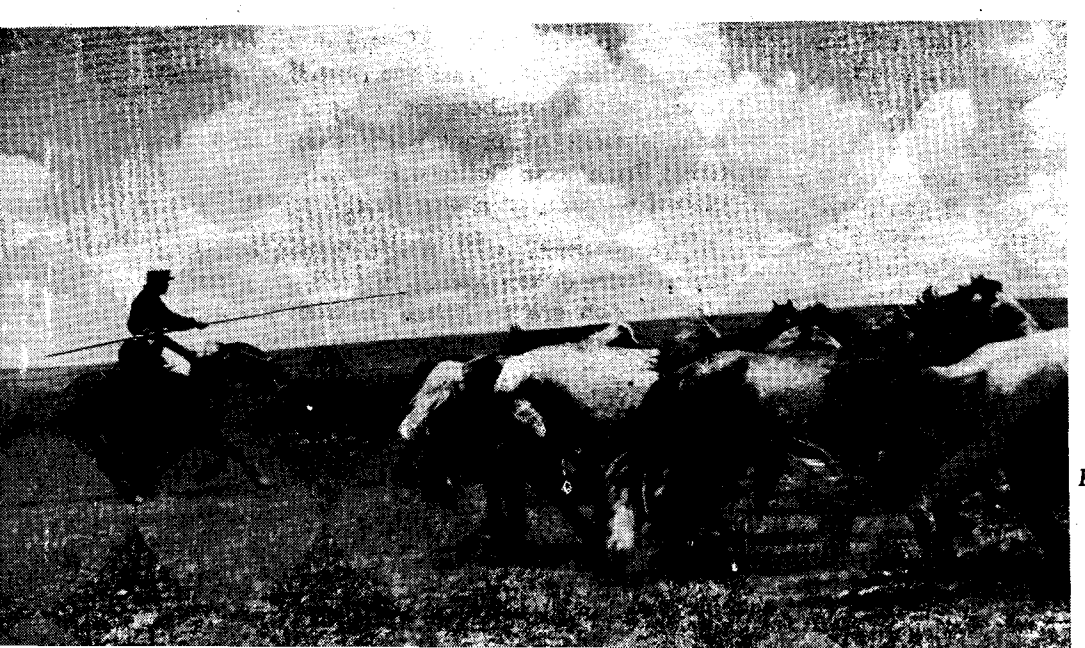
A view of pastureland.

Since the establishment of the Wulantuke Commune, which is bigger in size and has a higher degree of public ownership as compared with co-ops, favourable conditions have been created for expanding grassland capital construction. How the commune's third brigade solved the problem of water shortage is a good illustration. This brigade has a seven-hectare fodder base, but the source of water is some 3.5 kilometres distant. The brigade allocated a large work force to cut a ditch for diverting water to the base. But the water was lost through seepage halfway before it reached the base. Later the brigade planned to line the ditch with a seep-proof wall of stone quarried from a nearby hill, a project requiring three years' work by 30 able-bodied members. When the commune learnt of this plan, it assembled more than 100 young stalwart members from other