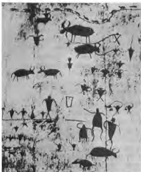
A Canyuan cliff painting.