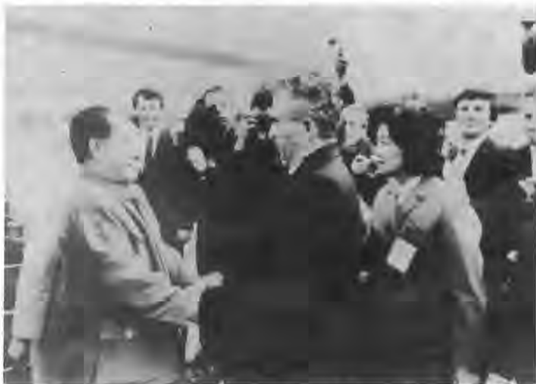
Hu Yaobang is warmly welcomed by Nicolae Ceausescu at the airport.

Hu Yaobang held several rounds of talks with Ceausescu. He also exchanged views on further developing economic relations, trade and technical co-operation between China and