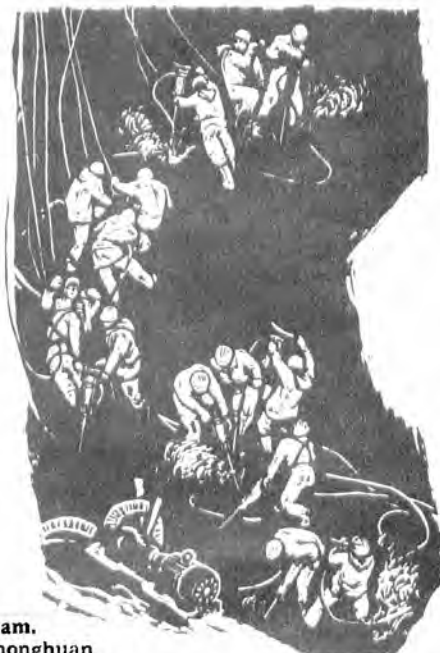
The Base of a Dam. by Lu Zhonghuan