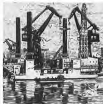
An offshore oil rig under construction. Woodcut by Zhang Jiarui

Reportage is a widely welcomed literary form which covers present-day China's current events and personal profiles (p. 28).