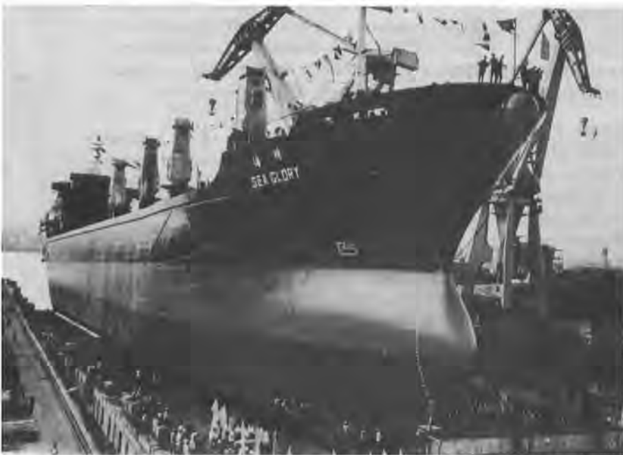
"Sea Glory" constructed by the Dalian Shipyard for Xianggang's Green Island Cement Inc.

Not only were the ships found to meet international standards, but the inspectors could find no errors.