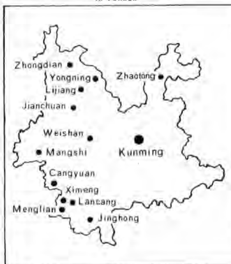
Locations of Cliff Paintings by Minority Nationalities in Yunnan

The Lijiang murals are religious works from temples and monasteries done between the 15th and 17th centuries when the area was under the rule of the tribe chiefs of the Naxi