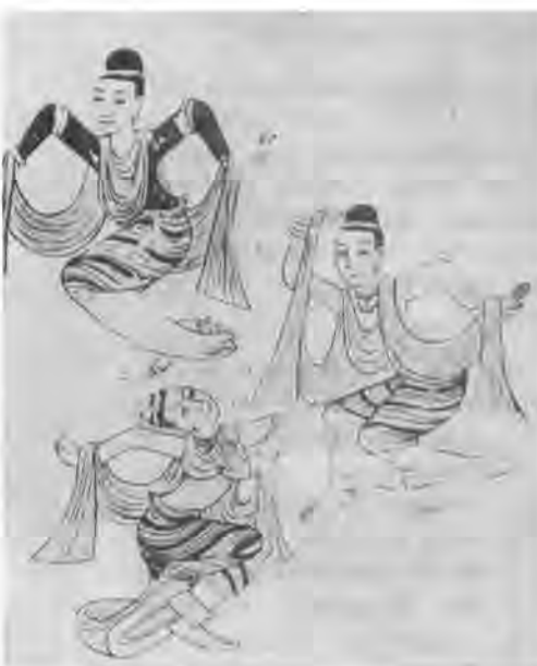
A Dai nationality mural "Festive Dance."

nationality. In over 10 temples at seven locations of the Lijiang County, the murals vary in content and style, as they were painted over many years by artists of different nationalities, including Bai, Han, Naxi and Tibetan. Those painted in the earlier period take their themes