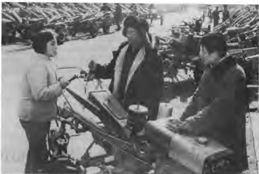
Better-off peasants are keen on getting their own walking tractors.

It is clear from what has been written above that the reforms now in progress in China cover a wide range and use, in certain aspects beneficial experiences in the capitalist countries. But the reforms as such involve only management