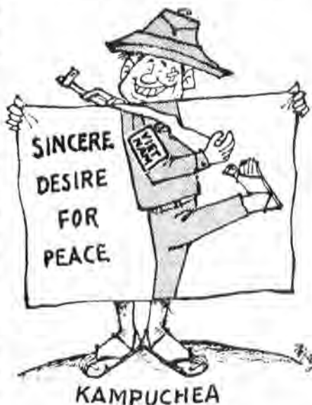
Cartoon by Fang Cheng

Last July Viet Nam announced that it would "partially withdraw" troops from Kampuchea. However, the fact is that it did not withdraw its troops but rather sent new troops into Kampuchea and moved weapons into the Kampuchean-Thai border region. In March-April Viet Nam launched new military offensives along the Kampuchean-Thai border and intentionally invaded Thai territories many times. This proves that the July announcement of a "partial troop withdrawal" was completely a fraud.