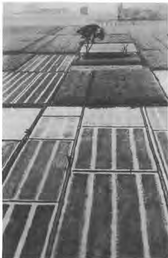
A commune's seed multiplication farm set up in Jiangxi's Gaoan County following the adoption of the contract system of responsibility.

Our goal is to establish a system of ownership commensurate with China's present developmental level (low and uneven) of production. Industry of the modern type, wholesale business and major retail commerce, mechanized state farms, communications and transport and other economic lifelines will be operated under ownership by the whole people and kept in the hands of the state. The collective and individual economies will be given more scope in the spheres of agriculture, small-scale industries, handicrafts, ordinary retail commerce and service trades. In addition, some joint ventures with Chinese and foreign investment will be selected for bigger development and there will be various structures of association of enterprises under different forms of ownership for joint operation. In this way, the diverse economic forms based on the socialist public ownership will, within a definite scope of management, turn the advantages so gained to full account and complement each other.