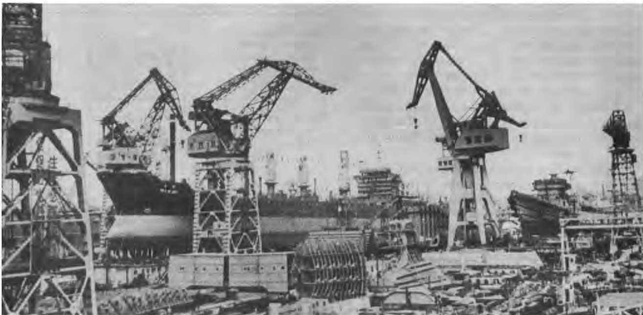
A glimpse of the Dalian Shipyard.

The section chief of the cutting section of the hull workshop said that 80 per cent of the steel plates for exported ships were cut by programme-controlled machines. The computer programmes the machines to meet exact specifications and can direct the simultaneous cutting of three steel plates 2 metres wide and 7 metres long.