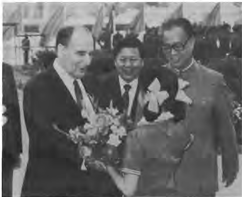
Premier Zhao welcomes President Mitterrand.

"China has no personal interests in Kampuchea. We sincerely hope that Kampuchea will become an independent, peaceful, neutral, and non-aligned country."