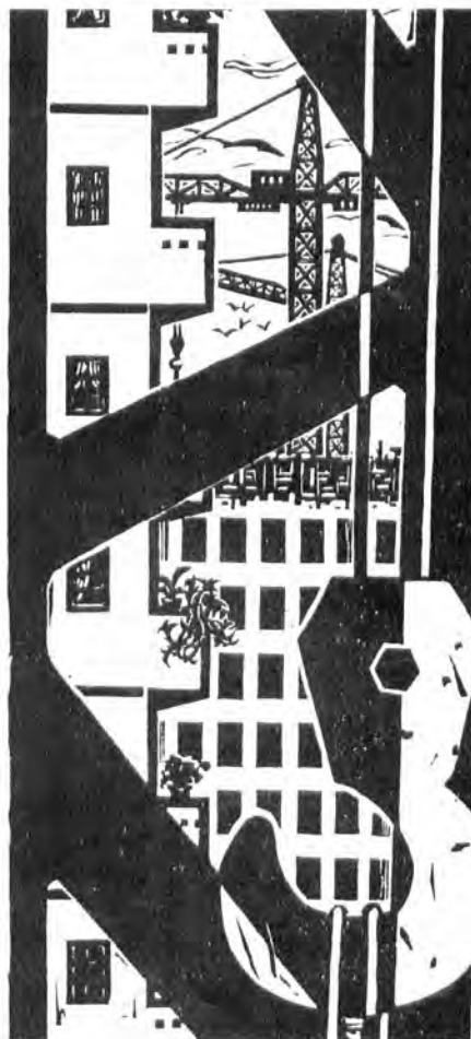
Putting Up More Residential Houses. by Zhang Dimao

Varied woodcut themes reflect the diversity of modernization efforts in Chinese industry. The bold, clean lines and sharp contrast of some capture the enormity of the task while the finely delineated and delicate quality of others suggest the complexity of change.