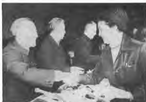
Huang Zongying (right) receiving her award.