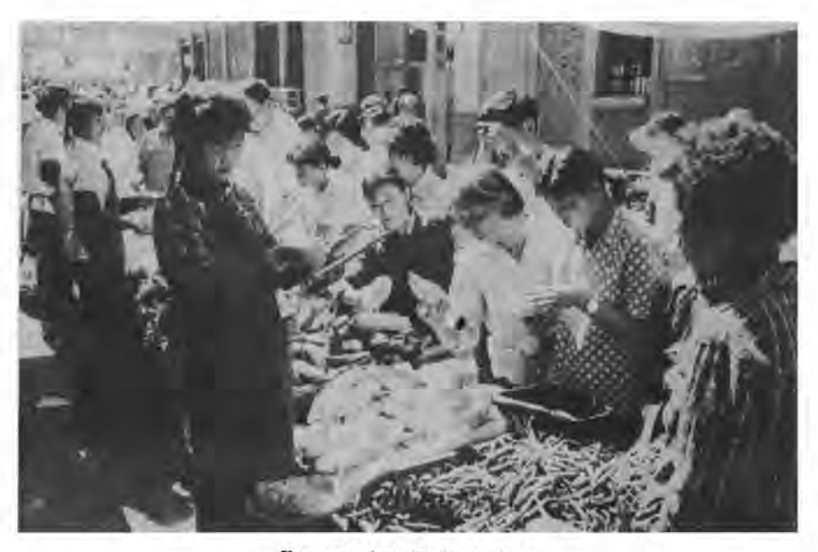
Free market in Kunming.

At that time, the variety of goods was extremely limited. An urban dweller could buy