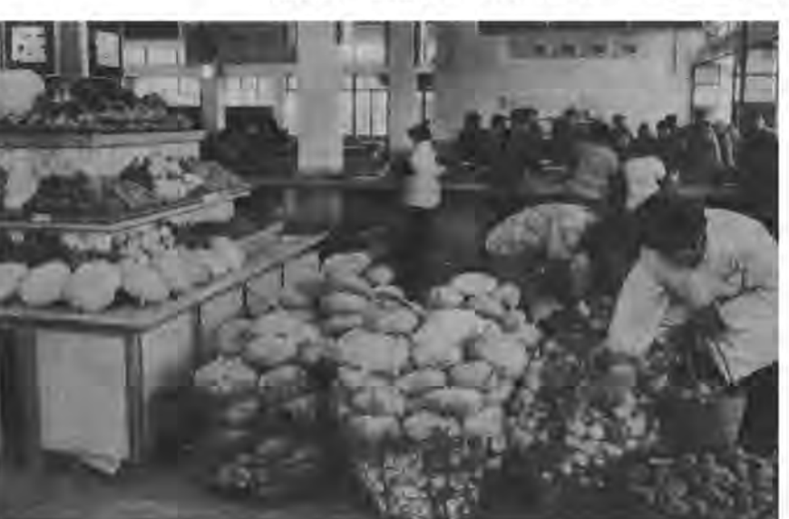
Co-operative 'vegetable market in Shanghai.

Although the last three categories include a large variety