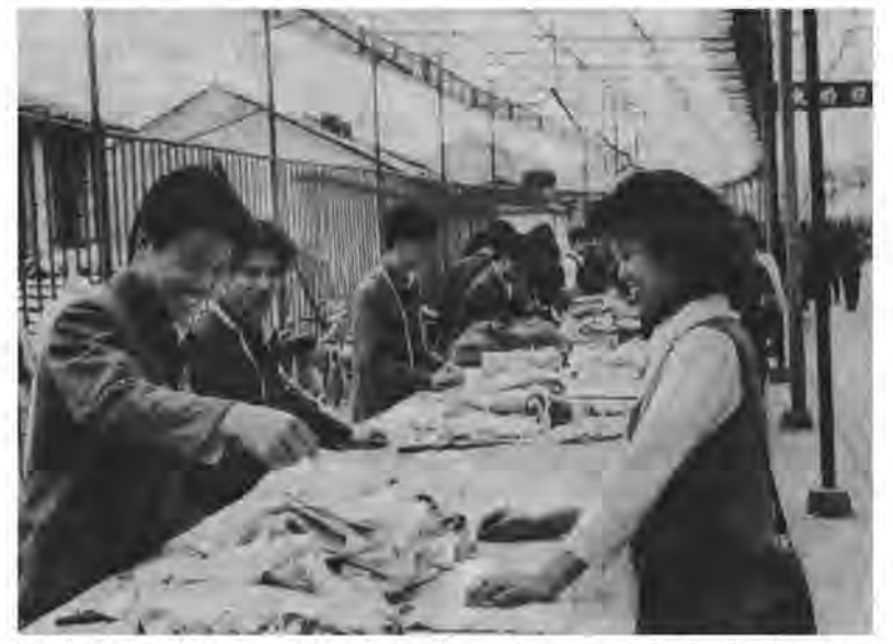
Good service attracts more customers for self-employed tailors in Changzhou.

as a whole, it is necessary to strengthen control over individual retailers, particularly over prices. The government also must adopt effective measures to protect individuals' legitimate rights and eliminate illegal activities so as to enable the individual economy to better supplement the state and collective economy and make things convenient for the people.