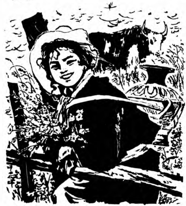
Girl of the Grasslands.