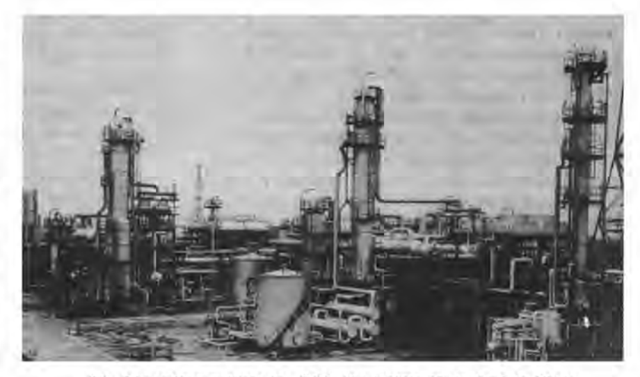
The Chuandong natural gas field, the largest of its kind in China, supplies desulphurized gas to numerous households.

There are satisfactory, indications that China has substantial oil and natural gas resources. A number of oil/gas fields are expected to be discovered