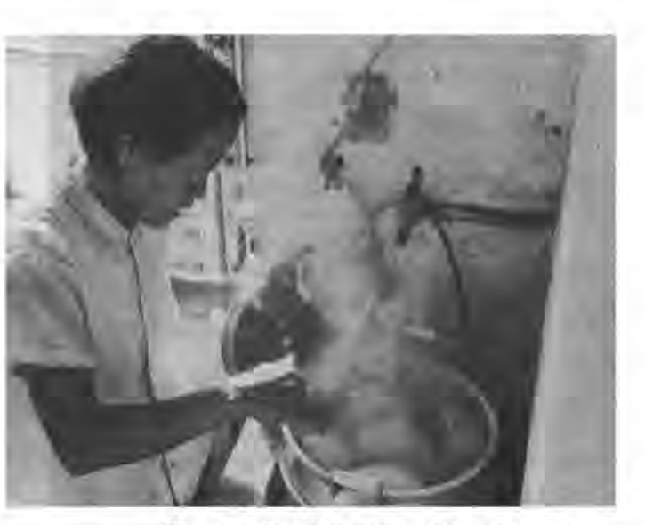
Biogas is becoming a commonly used fuel source in the rural areas.

By then, our firewood, if cut rationally, can supply one-third of the rural population's daily energy needs, the vegetation waste can