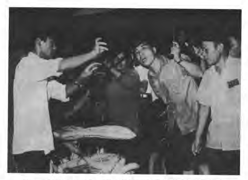
Price inspector of Nanchang, Jiangxi Province, at a market.

some state-owned shops have driven up negotiated prices.