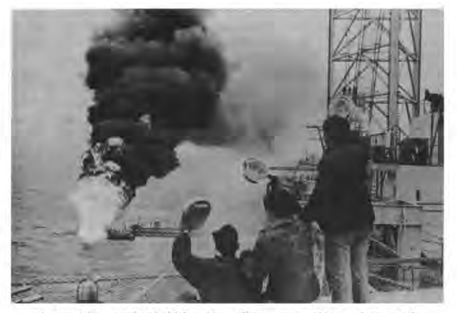
A recently completed high-output oil/gas well with a daily crude oil output of more than 1,000 tons in the Chinese-French co-operative area in the Beibu Gulf.

estimated 20 An per cent of the inproduction dustrial capacity is idle because of insufficient Furtherelectricity. the utilization more. production rate for capacity is low, which increases the energy consumption of perunit output value. The rural areas need at least 20 per cent more than is currently available. Today, the peasants have had little choice but to fell too many trees and burn too much vegetation waste, causing ecological deterioration.