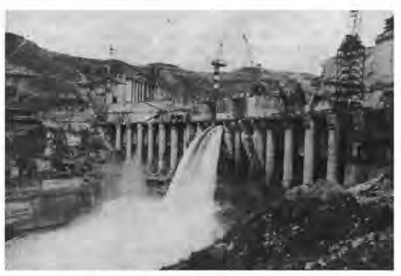
The Baishan hydropower station in Jilin Province now under construction. With a total installed capacity of 1.5 million kw, the station will ease the electricity shortage in northeast China's three provinces.

In addition, it plans to attract foreign investments and to import advanced technology to step up the construction of coal mines, rail-