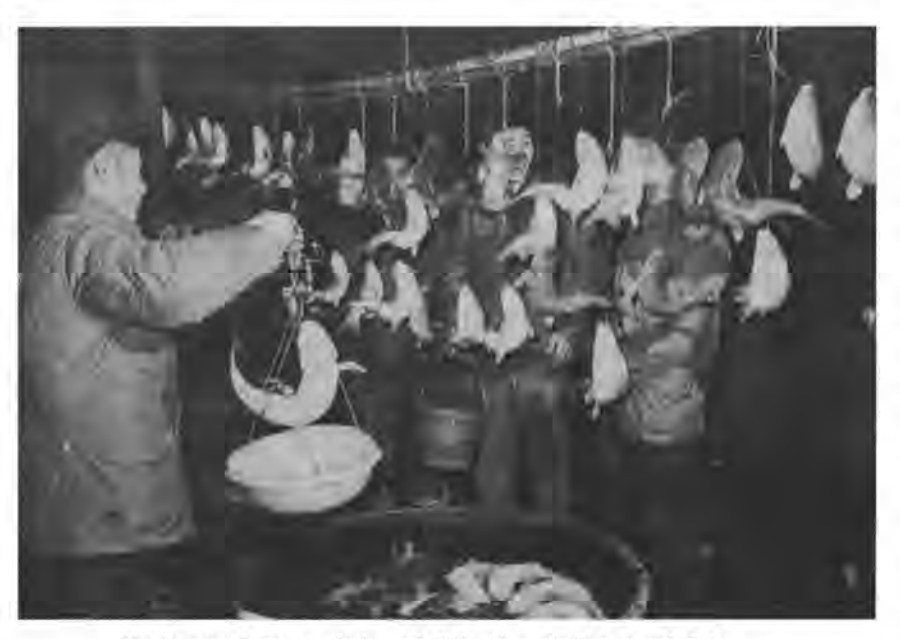
Customers have a choice of fish at a Fujian rural fair.

the subsidies cannot be abolished for the time being. However, the scope and the amount of subsidies will be strictly controlled and will not be expanded. Appropriate measures will be taken to reduce gradually the amount of subsidies so as to concentrate adequate funds on key state projects.