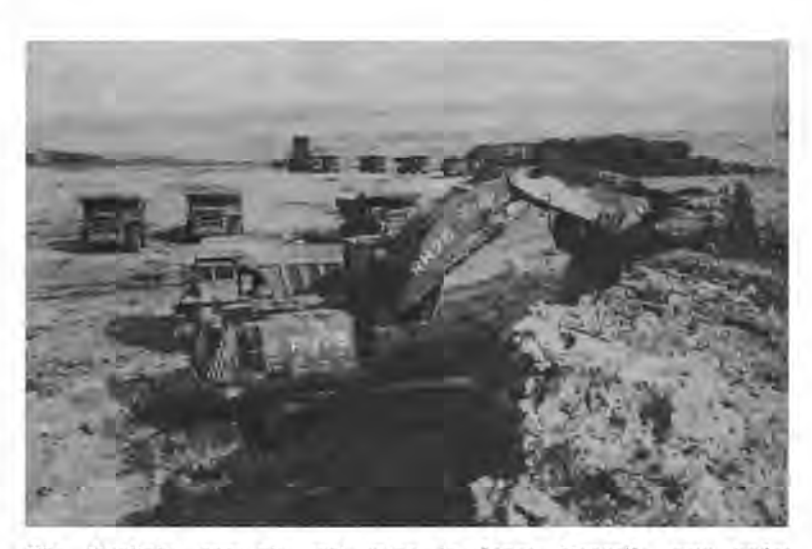
The Huolinhe open-pit coal mine in Inner Mongolia now under construction. With a verified deposit of 12,900 million tons of brown coal, the mine will be completed by the end of the century with an annual output of 50 million tons.

China has the world's largest water energy resources, with a potential reserve of 680 million kw, which can generate 5,900,000 million