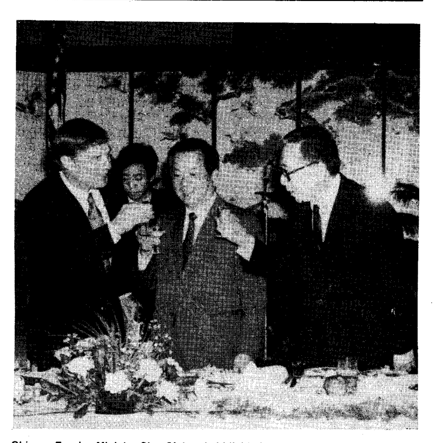
Chinese Foreign Minister Qian Qichen (middle) held a reception marking the 10th anniversary of the establishment of Sino-American diplomatic relations. Chinese Vice Premier Wu Xueqian (right) and US Ambassador Winston Lord (left) attended the reception.

At the time when Japan struck China with a war of aggression, the United States was battling its own great economic recession. The US government then did not consider China's security a matter of life and death as far as US