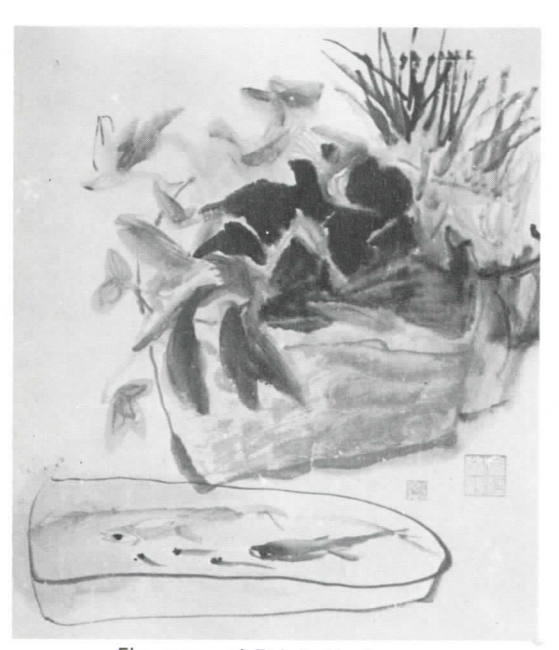
Flowers and Fish in Spring.