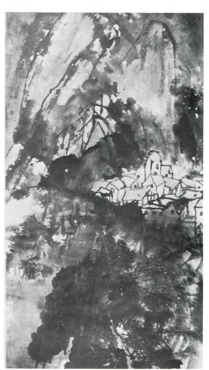
Near a Village