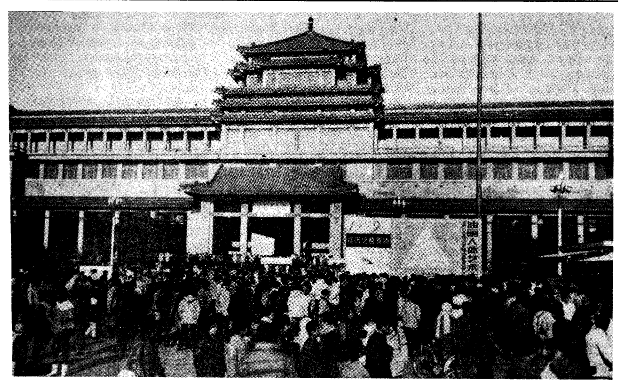
A large crowd queues to visit China's first exhibition of nude paintings at the China Art Gallery.