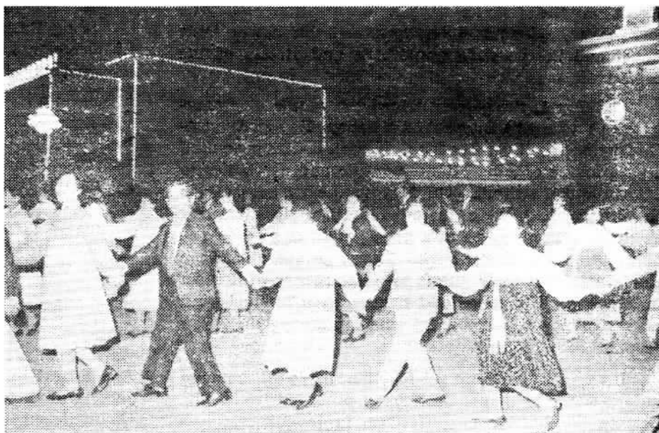
Players from many countries join with Pyongyang citizens at Kim Il Sung Square to celebrate May Day.

The number of junior players at the Pyongyang championships was 60, twice as many as the number at the previous championships. These young players had something in common: a strong sense of attack and a game based on offense. Some teams such as Singapore, Indonesia and Hongkong fielded junior players in the team events so that the youngsters could meet strong