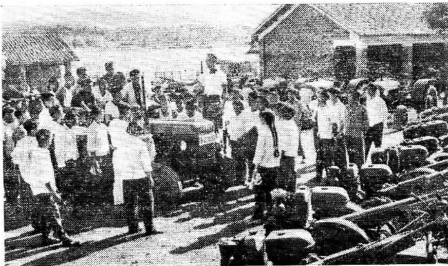
Members of a county farm tool research institute in Hunan Province training tractor drivers for the communes.

In recent years, large numbers of power-operated wells have been sunk in the north China plain to use ground water for irrigation. This has brought in its wake a marked increase in the production of diesel engines.