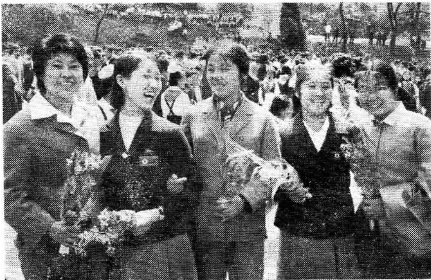
Chinese and Korean players at a get-together in a park.

It was a magnificent get-together, made all the more unforgettable by demonstrations of profound friendship. Despite the barrier of difference in languages, hosts and guests were able to express their sentiments of "promoting friendship" in a variety of ways. Indeed,