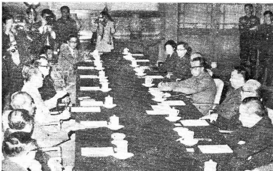
Premier Hua Kuo-feng and Prime Minister Lee Kuan Yew hold talks.

The people of China and Singapore have a profound traditional friendship. They have always shown sympathy for and supported each other in their struggle against imperialism and colonialism and to safeguard national independence and state sovereignty. In recent years, friendly contacts between the two countries have increased steadily. The current visit by Prime Minister Lee Kuan Yew at the head of a delegation will