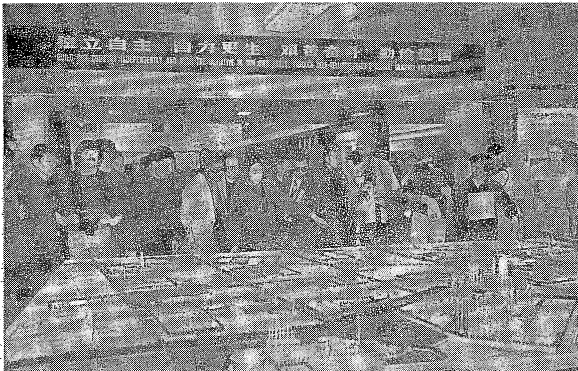
Foreign visitors to the Chinese Export Commodities Fair see a scale model of the Taching Oilfield, the red banner on the industrial front.

maintaining independence and keeping the initiative in our own hands and relying on our own efforts. The state determines what to export and import and in what quantities. This has put an end to imperialist dumping, their disrupting of China's national economy, getting raw materials for next to nothing and plundering the country's resources. Because both imports and exports are handled by the state in an overall manner, the foreign trade deficits which had plagued the country before liberation were quickly eliminated. And, as the country differentiates prices on the home market from the foreign market, the constant price fluctuations and the economic crises of the capitalist world cannot adversely affect the economy. The principle of maintaining independence and self-reliance has enabled foreign trade to play a useful role in promoting socialist construction, break the imperialist blockade and embargo, counter trade discrimination and the sudden economic onslaughts of social-imperialists. Foreign trade has continually expanded following the steady development of China's national economy.