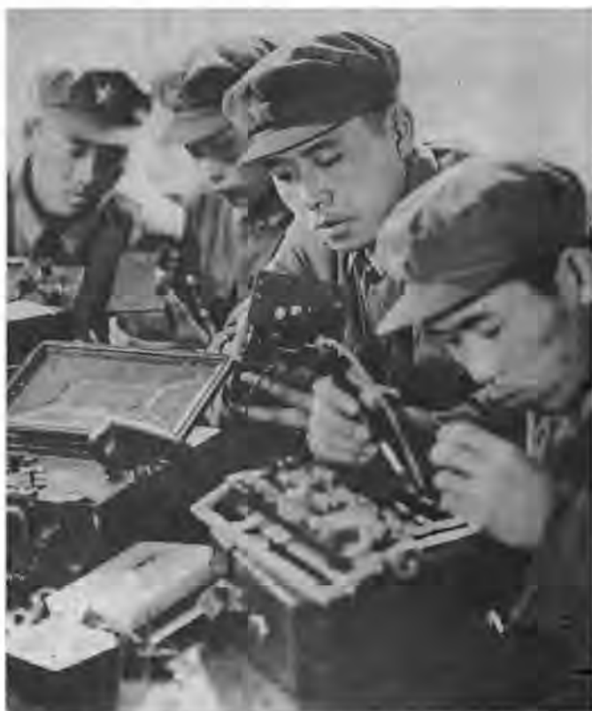
Soldiers of a PLA company learning about electrical machinery.

Training classes were established at the regimental, battalion and company levels. Many soldiers doubled as students of both military and civilian skills. Some served as teachers in one class and became learners in another; 403 people were chosen as part-time teachers.