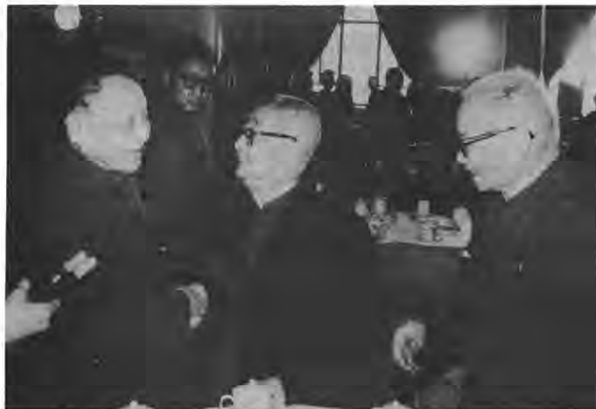
Deng Xiaoping talking with Zhou Jianren (middle), Chairman of the China Association for Promoting Democracy, and Ji Fang (right), Chairman of the Chinese Peasants' and Workers' Democratic Party, at a tea party on February 5, 1981.

handled properly in the draft. For instance, we properly approached the issue of whether to categorize Comrade Mao Zedong's errors as relating to the Party line. We decided not to refer to them in that way, taking into consideration the fact that such expressions as "the struggle between the two lines" and "errors relating to the Party line" were used incorrectly, indiscriminately and too often in the past. With hindsight I think many cases in the Party's history of two-line struggles, as we used to call them, clearly cannot be established. Two of them ought to be completely reversed. They are the case of Liu Shaoqi, Peng Zhen, Luo Ruiqing, Lu Dingyi and Yang Shangkun 31 and the case of Peng Dehuai, Huang Kecheng, Zhang Wentian and Zhou Xiaozhou 32 . The basic verdict in the case of Gao Gang and Rao Shushi remains unchanged, but this case can hardly be categorized as a struggle between the two lines. Luo Zhanglong was said to have committed errors relating to the Party line, but frankly, I think this way of categorizing it fails to hit the nail on the head. What Luo Zhanglong actually did was to engage in factional strife, split the Party and form another Party central committee. The case of Gao Gang and Rao Shushi is of a similar nature though, of course, they didn't go so far as to form another Party central committee. Qu Qiubai's errors lasted less than half a year and Li