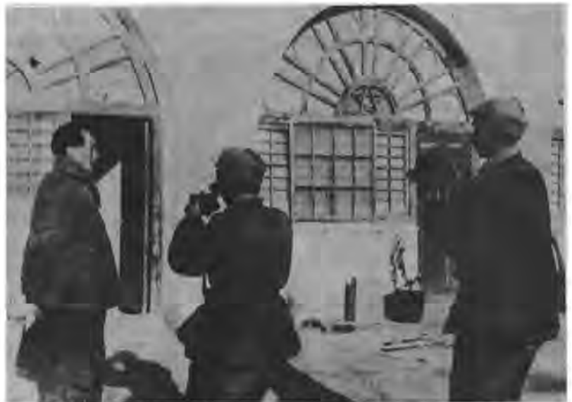
Film workers at work on the newsreel "Life in Yanan" in the Date Garden in spring 1946.

The studio is helping to promote international understanding of China. It produces numerous series that cover the development of China's socialist construction as well as its